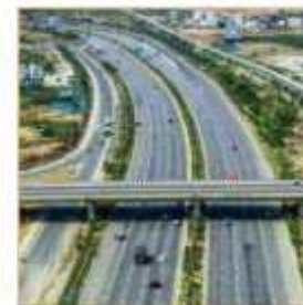
Proposed 340 km Regional Ring Road