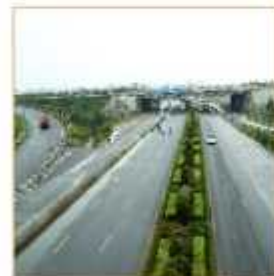
ORR Junction - Shamshabad